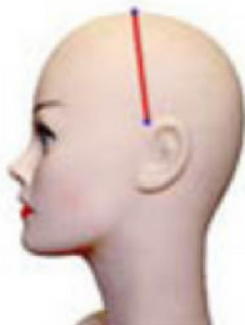
EAR TO EAR OVER TOP