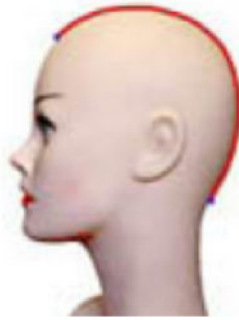
FRONT TO NAPE