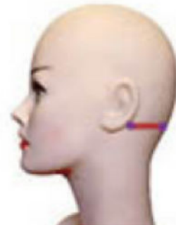
NAPE OF NECK