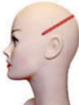
TEMPLE TO TEMPLE AROUND BACK